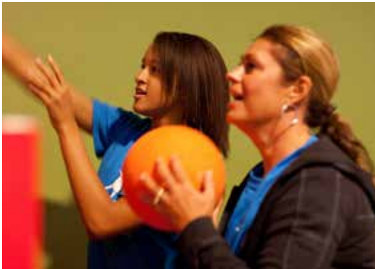
Photo courtesy of The Mentoring Partnership of Southwestern Pennsylvania, © Renee Rosensteel, used with permission

Monitoring of mentoring relationships should follow a standardized procedure for both mentors and mentees in order to solicit information about the mentoring relationship (B.5.2 & B.5.3) . The goal of assessing this information on a monthly basis is to help protect child safety and allow program staff to provide feedback and tailored support to the mentoring relationship. The procedure should include questions about recent mentoring activities, mentee outcomes, child safety issues, the quality of the mentoring relationship, and perceptions of the impact of mentoring on the mentor and mentee. The standardized procedure must also include instructions for documenting each monitoring contact, including the date, time, and key information gathered during the contact.