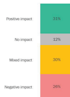
Impact of COVID-19 pandemic on mentoring relationships Among mentors

Base: Nationally Representative Sample who mentor (Total Answering n=111).