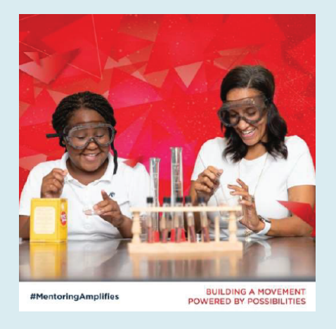
<u>Mentoring Amplifies</u> <u>Visuals and Graphics</u>

Support National Mentoring Month by utilizing our toolkits, logo, graphics, and more!